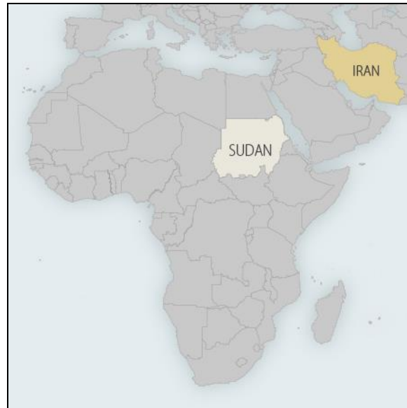
Figure 5. Sudan

Rouhani has made few statements on relations with countries in Africa and has apparently not made the continent a priority. However, the lifting of Iran sanctions could produce expanded