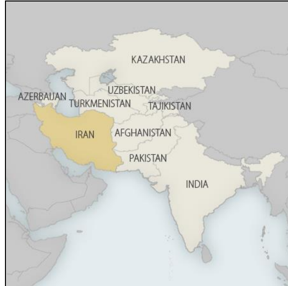
Figure 3. South and Central Asia Region

Most of the Central Asia states that were part of the Soviet Union are governed by authoritarian leaders. Afghanistan remains politically weak, and Iran is able to exert influence there. Some countries in the region, particularly India, seek greater integration with the United States and other world powers and tend to downplay cooperation with Iran. The following sections cover those countries in the Caucasus and South and Central Asia that have significant economic and political relationships with Iran.