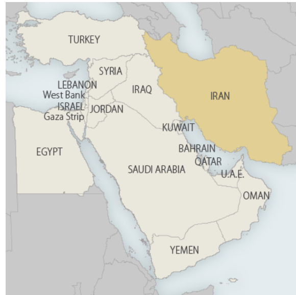
Figure 1. Map of Near East

Several of the GCC leaders have accused Iran of fomenting unrest among Shiite communities in the GCC states, particularly those in the Eastern Provinces of Saudi Arabia and in Bahrain, which has a majority Shiite population. At the same time, all the GCC states maintain relatively normal trading relations with Iran, and some have undertaken or considered joint energy and transportation projects with it. In early 2017, Iran sought to ease tensions with the GCC countries in an exchange of letters and visits arranged through the intermediation of Kuwait. The initiative produced a February 2017 visit by President Hassan Rouhani to Kuwait and Oman, but the same regional issues that divide Iran and the GCC countries thwarted the initiative.