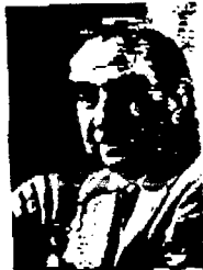
Banquet, November 16th Dr. Edward Teller