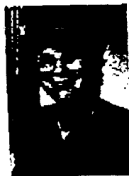
Luncheon, November 17th The Honorable Janet Reno Attorney General of the United States