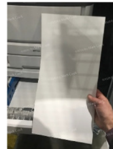
Ballot printer loaded with blank ballot paper.