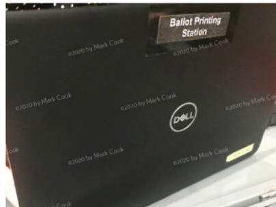
Ballot designer computer, connected to ballot printer.